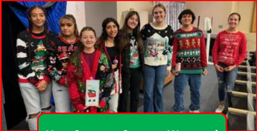
UGLY SWEATER CONTEST WINNERS!